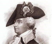
General "Mad" Anthony Wayne

5. General "Mad" Anthony Wayne, one of Washington's senior commanders died in Northwestern Pennsylvania in the city of Erie after the revolution in 1796. His body was originally buried in Erie, but his family asked his body be exhumed and reburied in the Southeastern part of the state at the family's cemetery plot. With the inability to move his body that far in the 1790s, a choice was made to speed up decomposition and allow his bones to travel to Radnor, PA. Many claims to have seen his apparition along the US Route 322 road.