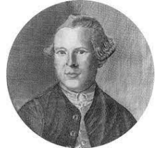
Dr. Joseph Warren

2. Visions of Joseph Warren: Joseph Warren, a prominent American patriot, and leader during the early stages of the Revolution, reportedly had visions that foreshadowed his death at the Battle of Bunker Hill. According to some accounts, he had premonitions and expressed his belief that he would not survive the battle.